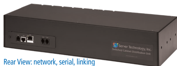
Rear View: network, serial, linking and temperature/humidity inputs