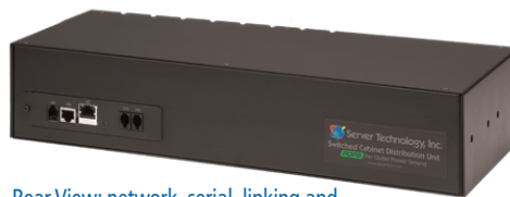
Rear View: network, serial, linking and temperature/humidity inputs