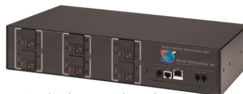
Rear View: breakers, network, serial, linking and temperature/humidity inputs