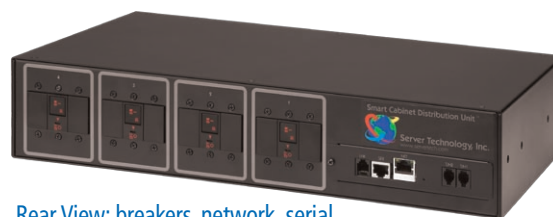
Rear View: breakers, network, serial, linking and temperature/humidity inputs

Expansion Module Model Numbers > CL-4HDX452B6 > CL-4HDV452B6 > CL-4HYY452B8