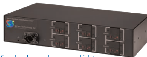
Rear View: breakers and power cord inlet