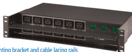
Mounting bracket and cable lacing rails