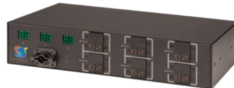
Rear View: breakers, cord, and LED meters